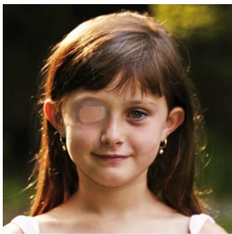
Patching to treat left eye amblyopia

Patching is very hard work for both parents and children. Most children, even in infancy, object to the patch or sometimes simply fall asleep when it is put on.