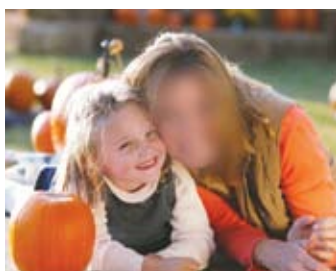
Vision with moderate diabetic retinopathy