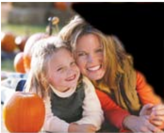
Vision with a curtain or shadow