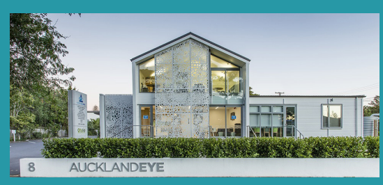
8 St Marks Rd, Remuera

Yes, although if you have cataracts in both eyes you will probably have two separate surgeries, typically a week or more apart. This decision is made with you and your surgeon.