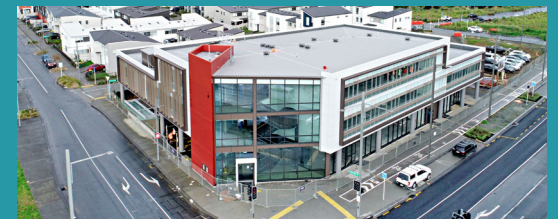
Ormiston Medical Clinic, 211 Ormiston Rd