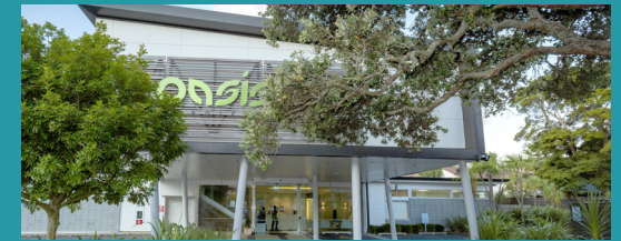
Oasis Surgical & Dry Eye Clinic, 2 MacMurray Rd, Remuera