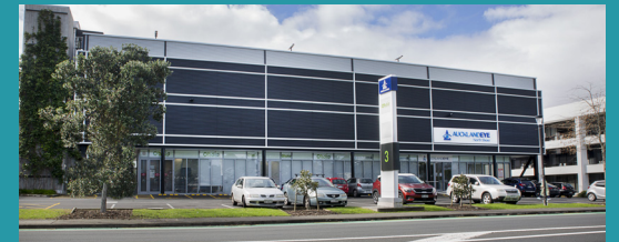
3 Fred Thomas Dr, Takapuna