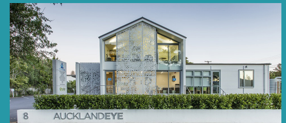
8 St Marks Rd, Remuera

Yes, although if you have cataracts in both eyes you will probably have two separate surgeries, typically a week or more apart. This decision is made with you and your surgeon.