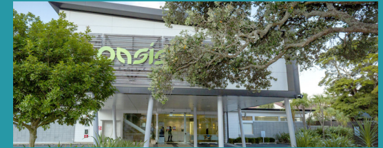
Oasis Surgical & Dry Eye Clinic, 2 MacMurray Rd, Remuera