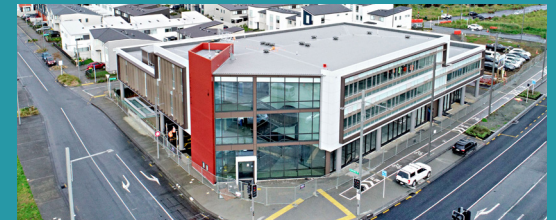
Ormiston Medical Clinic, 211 Ormiston Rd