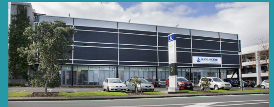
3 Fred Thomas Dr, Takapuna